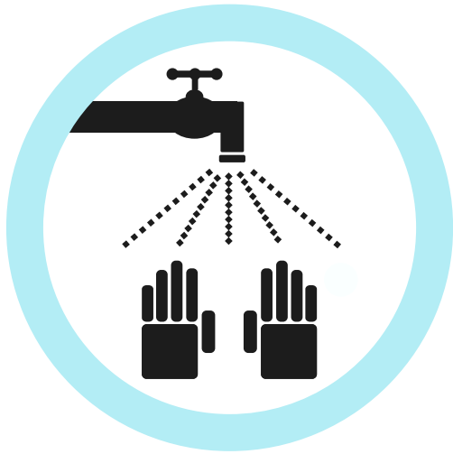
Wash Hands Thoroughly